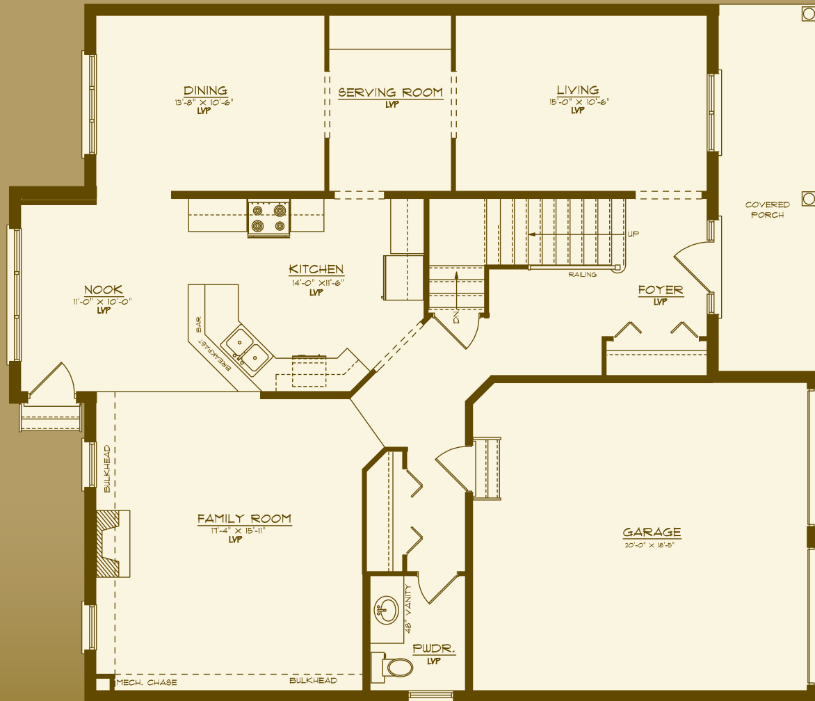
Main Floor 1,369 Sq. Ft.